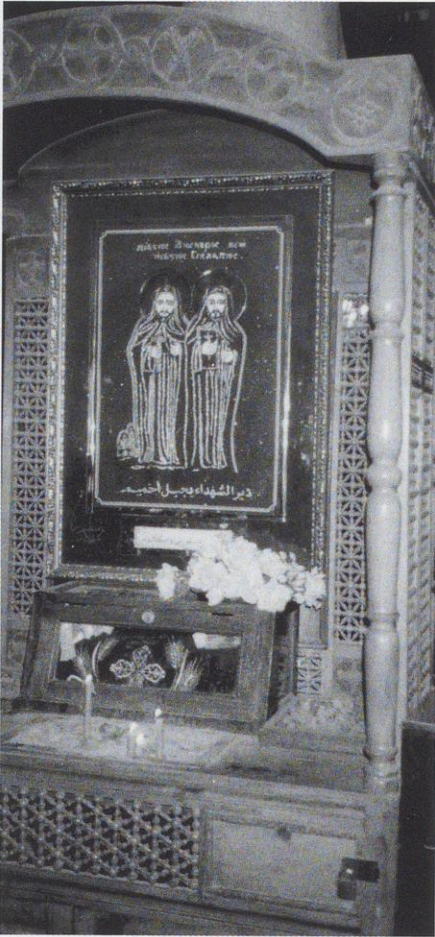
Relics of Sts. Asclepius and Dioscorus. Church of St. Shenuda, Old Cairo.