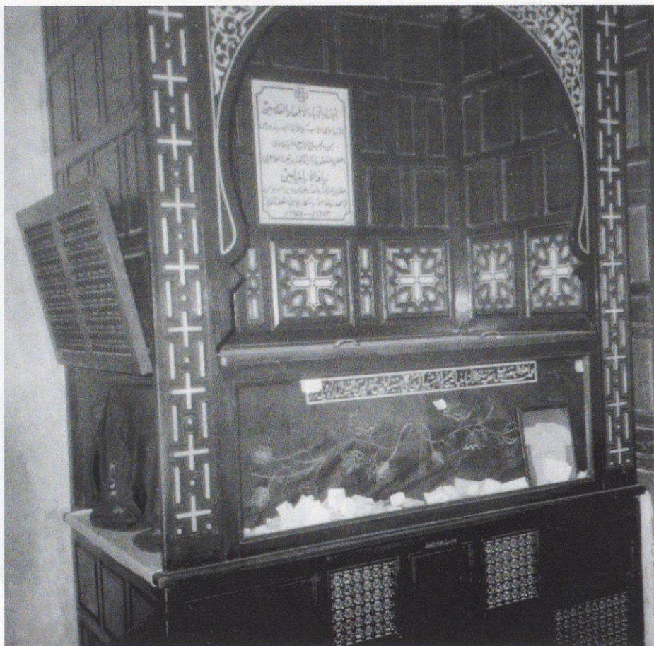
Relics of Sts. Moses the Black and Isidore with votive offerings. Church of the Holy Virgin, Monastery of al-Baramūs.

were covered with new white linen sheets. On account of obvious marks of torture on the mummies, the church declared them to be martyrs of the Christian faith.