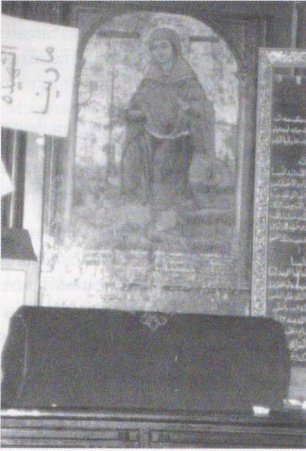
Relics of St. Marina. Church of the Holy Virgin, Harat ar-Rum, Cairo. Icon by Astasi ar-Rūmī al-Qudṣī, 19 th cent.