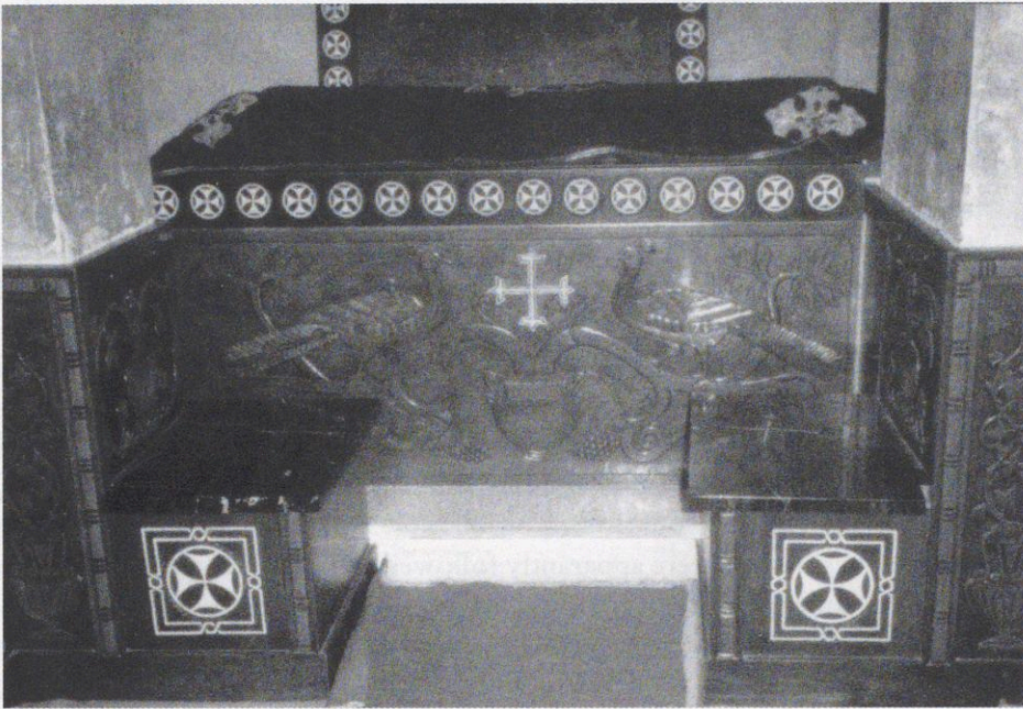
Chest with relics of St. John the Baptist and the Old Testament Prophet Elisha. Wādī' n-Naṭrūn.

St. Macarius of the Wādī 'n-Naṭrūn. This had occurred in Lent 1976 while restoring and extending the Church of St. Macarius. Upon my questions, Pope Shenuda III avoided any form of confirmation of the claims by the monks of the Monastery of St. Macarius 12 .