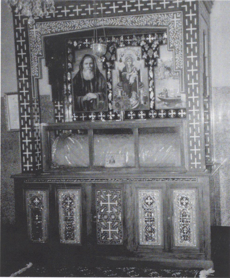
Relics of Anbā Michael al-Bukhari. Church of St George (northern wall), Dair al-Muḥarraḡ.

general Desaix de Veygoux had withdrawn his troops to al-Lahun and later to Seila, Sirsina, etc. east of Sinnuris. Villagers of the region of Ez. Qalamshah had fled to the ruined and deserted monastery where they were massacred by the soldiers of the Mameluke Murad Bey. So far no final agreement about the historical identity and the date of the massacred villagers of Naqlun has been reached. Many of the Coptic priests assign the martyrs of Fayyum (Naqlun) to the period of the great persecution at the beginning of the 4 th century. Their relics are found